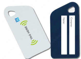
Screenshot – NFC NameCard App